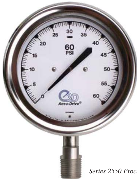
Series 2550 Process Gauge

THE SIMPLICITY, ACCURACY AND RELIABILITY OF 3D INSTRUMENTS' DIRECT DRIVE DESIGN PRESSURE GAUGES ARE AVAILABLE IN 2½ INCH AND 4½ INCH STAINLESS STEEL CASES. NO GEARS OR LEVERS MEANS FEWER PROBLEMS AND LONGER SERVICE LIFE.