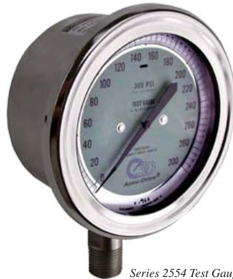
Series 2554 Test Gauge