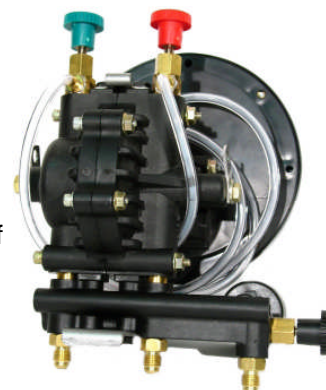
New Manifold Design