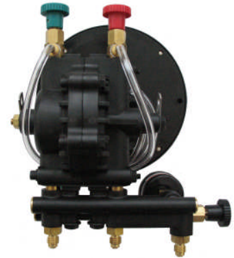
New Manifold Design