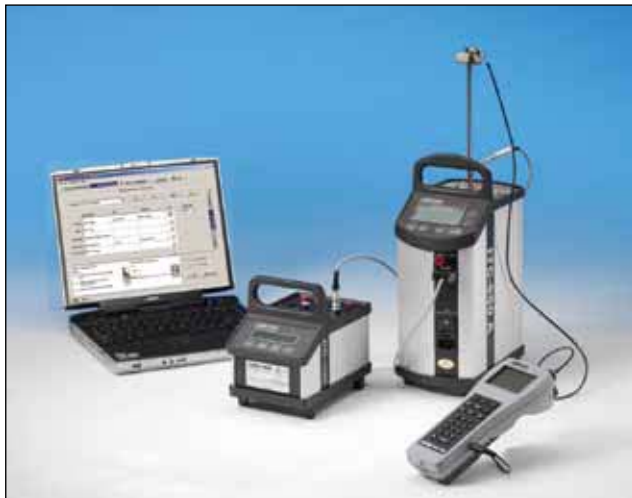
Set-up with JOFRA ASC300, ITC temperature calibrator and DTI-1000 reference thermometer connected to a PC with JOFRACAL