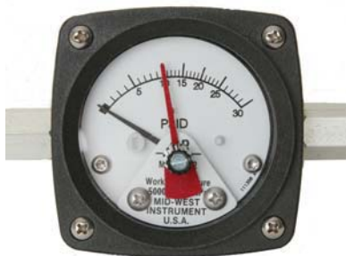
Model 122 0-30 PSID 2-1/2" Dial w/Maximum Follower Pointer

Due to precision sizing of piston and body bore, leakage across piston will not exceed 15 SCFH air at 100 PSID at ambient temperature.