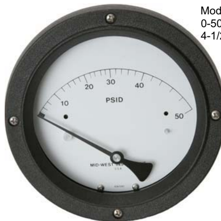
Model 122 0-50 PSID 4-1/2" Dial