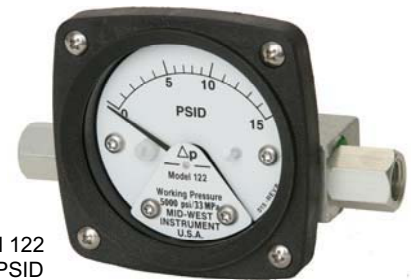
Model 122 0-15 PSID

An optional maximum indication follower pointer provides automatic indication of maximum differential occurring during a time period or system cycle. Reversed pressure ports are optionally available to facilitate installation and readability depending on which side of a filter, etc., the instrument must be installed.