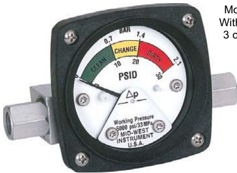
Model 122 With Special 3 color dial

A low cost differential pressure gauge for use in measuring the pressure drop across filters, strainers, separators, valves, pumps, chillers, etc., and for local flow indication and control.