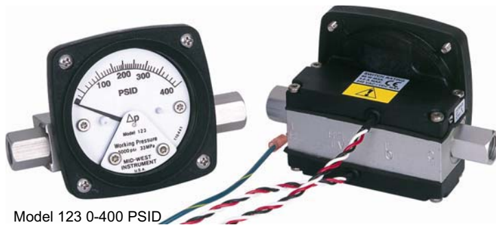
Model 123 0-400 PSID Shown with 2 Std. Switches

Due to precision sizing of piston and body bore, leakage across piston will not exceed 15 SCFH air at 100 PSID at ambient temperature.