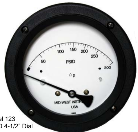
Model 123 0-300 PSID 4-1/2" Dial

An optional maximum indication follower pointer provides automatic indication of maximum differential occurring during a time period or system cycle. Reversed pressure ports are optionally available to facilitate installation and readability depending on which side of a filter, etc., the instrument must be installed.