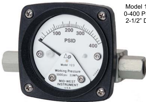
Model 123 0-400 PSID 2-1/2" Dial

A low cost differential pressure gauge for use in measuring the pressure drop across filters, strainers, separators, valves, pumps, chillers, etc., and for local flow indication and control.