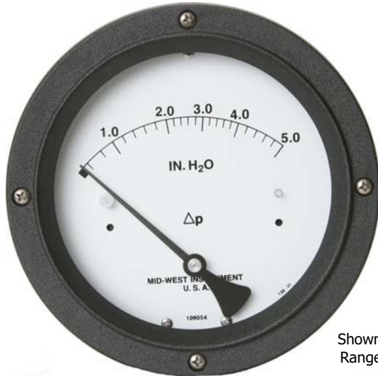
Shown here with Range 0-5" H 2 O

Model 130 is a rugged general purpose differential pressure gauge with a 4-1/2" round dial.