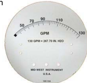
0-130 GPM Flow Gauge Scale

Common Applications: Tank Level Monitoring Horizontal or Vertical Flow, Liquid Level, Indication/Balancing, Filter Monitoring for Gases, Water Treatment Applications and Vacuum Application