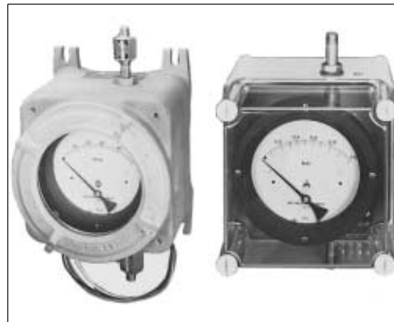
Model 130 in Explosion Proof (left) and NEMA 4X (right) enclosures