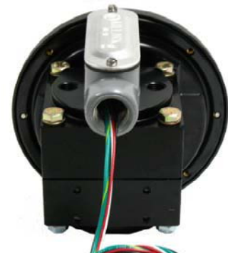
Shown w/Aluminum Body & (1) Reed Switch in Condulet enclosure

Model 130 is available in Aluminum, Brass and 316SS bodies only with one or two hermetically sealed reed switches for low and/or high limit alarm. These CSA listed switches are Single Pole Double Throw (SPDT) with adjustable set points. Switches can be set to activate/deactivate on rising or falling pressure. Switches are enclosed in a weather resistant housing. Switch setting is readily made with a screw adjustment.