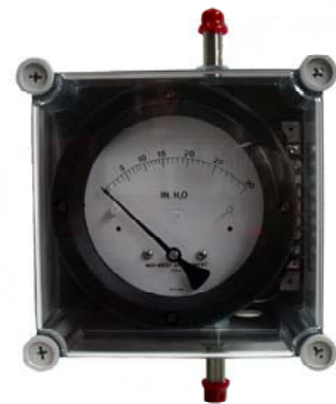
Shown in NEMA 4X Plastic enclosures

Factory preset switch at no extra charge (Specify Setting) Specify increasing or decreasing range to be set.