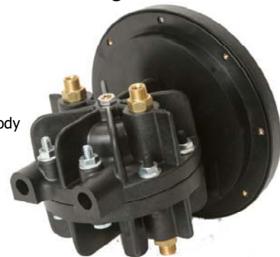
Shown with Engineered Plastic Body