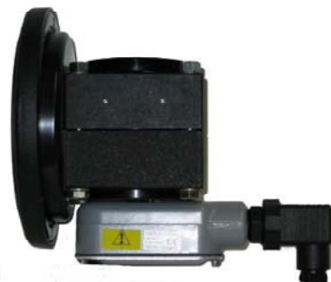
Shown w/Aluminum Body & (1) Reed Switch with Condulet enclosure and Plug-In Connector (Din 46350-PG 11)

CSA listed control switching is available in an explosion-proof enclosure which complies with NEC Class I, Groups C and D; Class II Groups E, F, and G; NEMA 7 and 9 standards. These are machined cast-aluminum enclosures with 1/2" FNPT conduit connection and 24" wire leads.