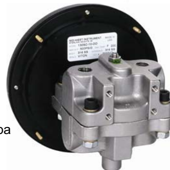
Shown with S.S. Cast Body